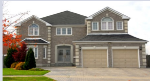
HOME SWEET, AFFORDABLE, HOME

Although markets cycle, real estate is a wise long term investment, and today's "perfect storm" of undesirable financial events has yielded some extraordinary buying opportunities.