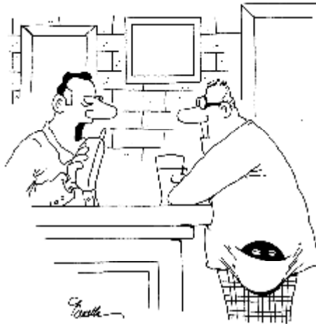
"It's the Pro Shop. Your bowling bag is ready."

The headline is a clue to the answer in the diagonal.