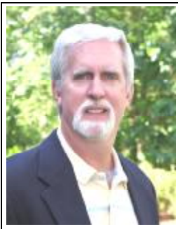
Ask the Expert