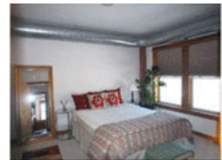
Attached 2b/1ba $169,000 $1395/Month Rental

5400 S. Harper Unit 1402 Chicago IL 60615