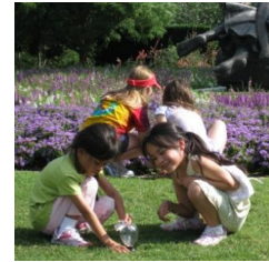
at the Arboretum!