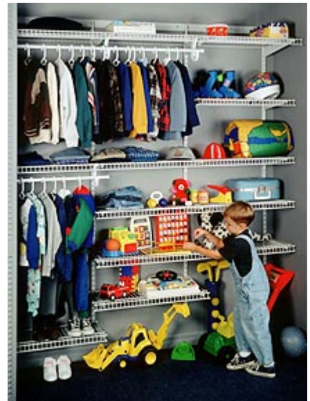
Closet organizers can help you keep everything in its place.