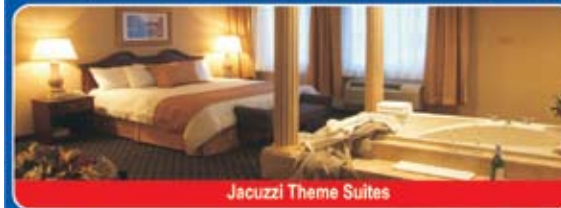
Jacuzzi Theme Suites