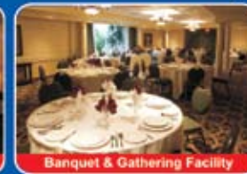
Banquet & Gathering Facility