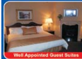
Well Appointed Guest Suites

"When The Destination Is As Important As The Journey"