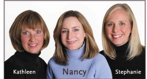
NANCY TALLMAN REAL ESTATE STRATEGISTS Three Licensed Real Estate Strategists/REALTORS® at Your Service in Park City, Utah

This conveniently located Pinebrook Pointe condo offers the best of both worlds. Views are towards the mountains and open space while the building is across the street from dining and shopping at Quarry Village and adjacent to trails. Well maintained condo with updated light fixtures.