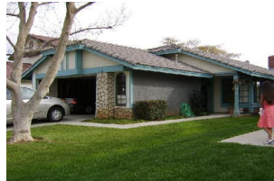
23865 Mark Twain,

Comments: 3/2 Gorgeous Home! Best Home For This Price. Completely Upgraded. New Kitchen Counter Tops And Cabinets And Flooring. Hardwood Flooring