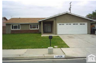
14928 Cliffrose, Morv,

Comments: Beautiful Home Located In Fast Growing Area In Moreno Valley. Near The 60 Freeway And Shopping Malls. Spacious Three Bdr. And Two Bath Home. Cozy Living Room