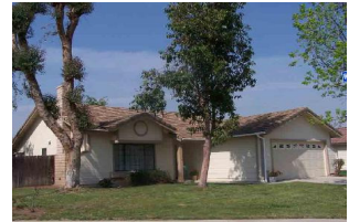
25664 Jonestown Dr,

Comments: North Of The Freeway, Charming, Clean And Comfortable. Shows Pride Of Ownership. Perfect For First Time Home Buyers, Or Someone Who Needs A